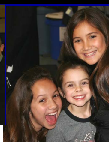
Awards Night was filled with Smiles