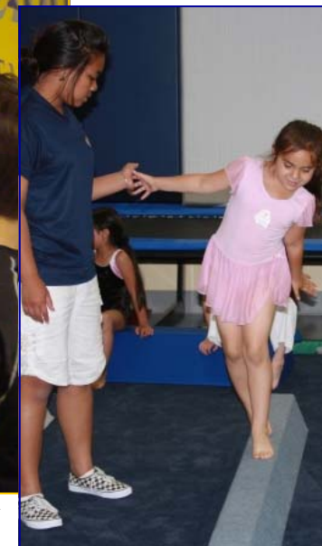
Gymnastics Class at Work