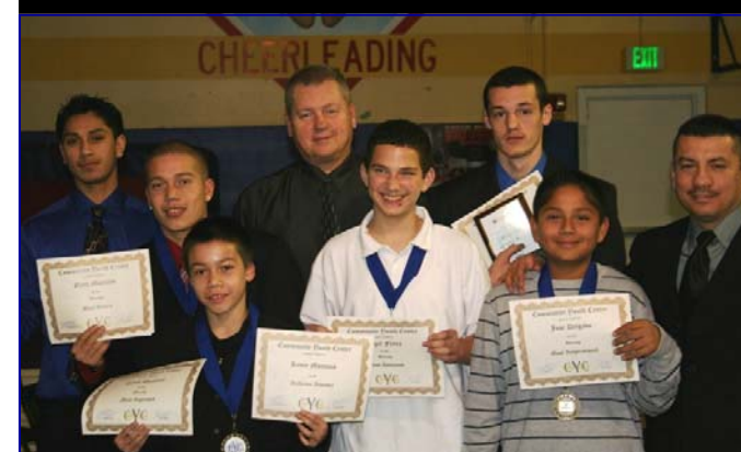
Boxers Show off Their Awards from the Awards Night